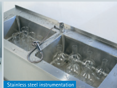
Stainless steel instrumentation