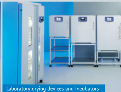
Laboratory drying devices and incubators