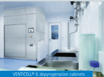
VENTICELL® IL depyrogenation cabinets