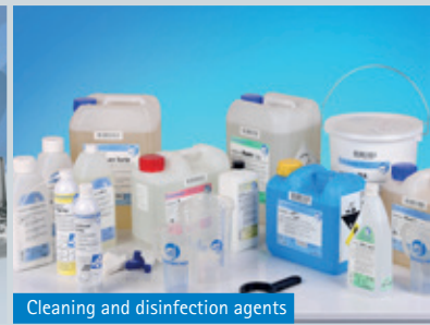
Cleaning and disinfection agents